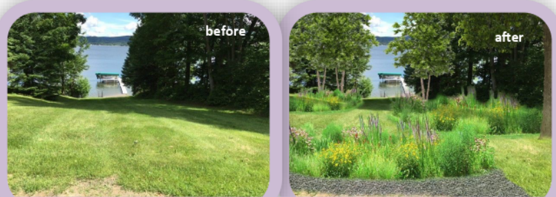
While keeping access and views, keystone species are used in stormwater practices to prevent pollution from entering the lake, like in these raingardens and tree plantings.

■ Reduce lawn with mowing less by creating “no-mow” zones, especially along the shoreline. Lawn kills ecosystems and the food source for songbirds and other wildlife.