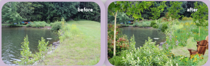
Native plantings restore a living shoreland, stabilizing the bank and protecting property