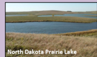
North Dakota Prairie Lake

Natural shores have either wetlands, forests and/or bedrock along most northern lakes. Few lakes have naturally occurring sandy shores.